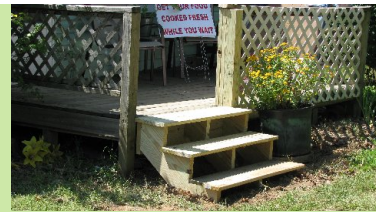
Before and after installation of stairs on back deck.